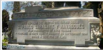
Mausoleum of Pablo Sarasate Available in formats of: 1l, 5l, 25l