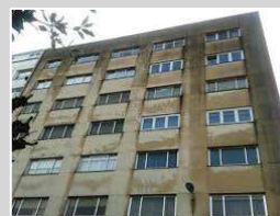
Presence of moisture