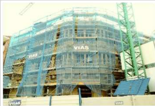
Mª Diez de Haro Building (La Rioja, Spain)