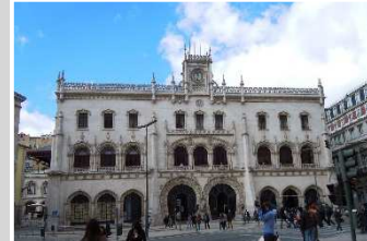
Rossio Train Station (Lisbon, Portugal)