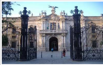
Old Royal Tobacco Factory Reclute University (Sevilla, Spain)