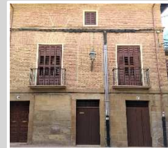
Private housing (Navarra- Spain)