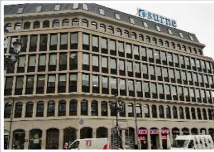
Surne Building (Bilbao, Spain)